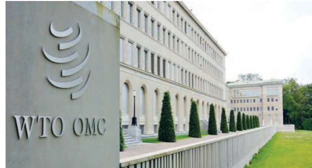
World Trade Organization(WTO)

Members of WTO: Director General, Four Deputy Director General, and other 600 Official Staff from around 80 member countries.