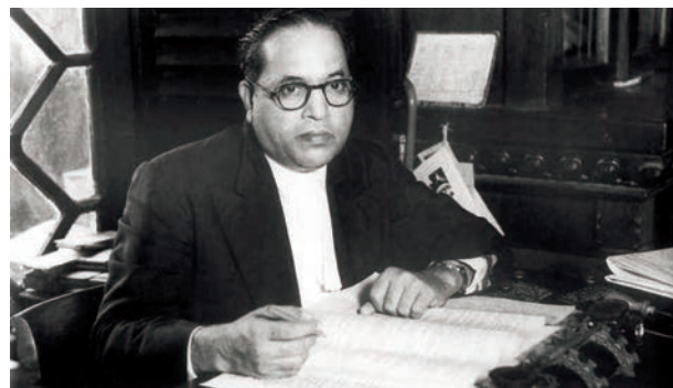
Dr. B.R. Ambedkar