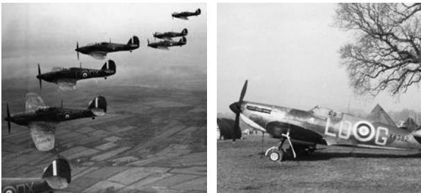
Royal Air Force

This campaign failed because with the aid of a newly developed and top secret device ‘radar’ for detecting aircraft while still at a distance, the fighter planes of the Royal Air Force were able to inflict severe losses on the German bombers. The raids stopped after October 1940. The Germans dropped their plans to invade Britain because of the failure of the air battle.