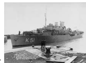
British Royal Navy

The British Royal Navy continued to be the most powerful among the European naval forces and ensured that a sea-borne invasion of Britain was not possible.