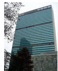
UN Headquarters, New York

The United Nations functions almost like any government, through its principal organs which are similar to the legislative, executive and judicial wings of a state. In the General Assembly is the body in which each member state