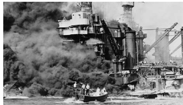
Pearl Harbour attack

On December 1941, Japan attacked American naval installations in Pearl Harbour, Hawaii, without warning. The idea was to cripple America's Pacific fleet so that Japan would not face any opposition in its offensive against South-east Asian countries. Many battleships and numerous fighter planes were destroyed. The United States declared war on Japan, with Britain and China also joining in. This brought together both the Asia Pacific and the European war into one common cause. Most importantly, it brought the United States with its enormous resources into the war as a part of the Allies.