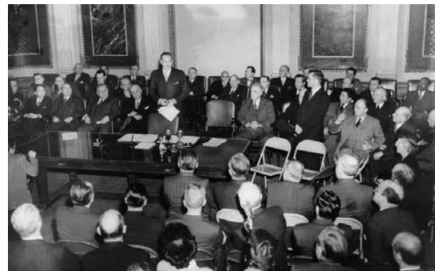
Bretton Woods Conference

The World Bank and the International Monetary Fund, referred to as the "Bretton Woods Twins", were both established in 1945 after the Bretton Woods Conference in 1944. Located in Washington D.C. in the United States, they have the same membership, since a country cannot be a member of the Bank without being a member of the Fund.