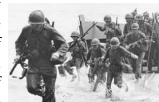
Battle of Guadalcanal

The US navy defeated the Japanese navy in the Battle of Midway, which turned the tide in favour of the Allies. The Battle of Guadalcanal in