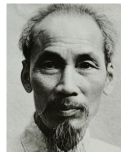
Ho Chi Minh

The mainstream political party in Indo-China was the Vietnam Nationalist Party. Formed in 1927, it was composed of the wealthy and middle class sections of the population. In 1929 the Vietnamese soldiers